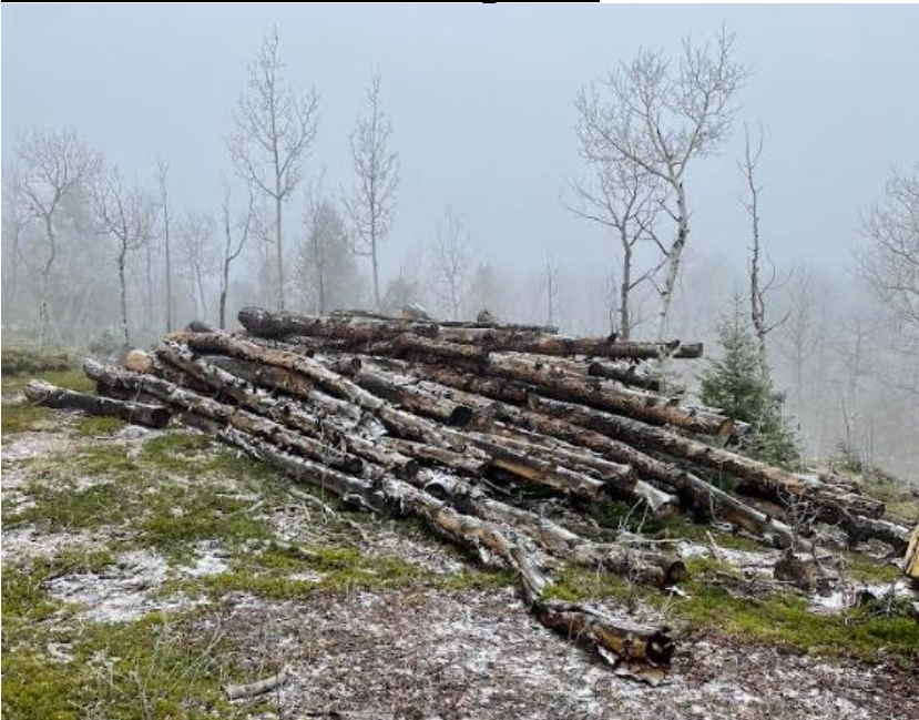
Figure 1. Log deck

Appendix 4 Pictures of Slash Pile and Log Deck