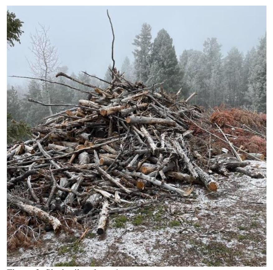
Figure 2. Slash pile, photo 1