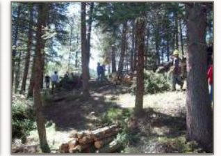
Thinning projects open up forest canopies, reducing wildfire risk & improving habitat