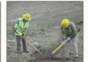
Maintaining trails improves access to natural areas & reduces erosion & other impacts