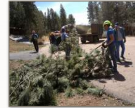
Chipping slash reduces fuels & wildfire risk in communities.

CUSP works to restore forests to historically healthy conditions and uses proven wildfire mitigation techniques to reduce wildfire risks for communities and vital resources. These proactive initiatives include maintaining 2 slash sites; chipping services for communities; assisting with Community Wildfire Protection Plans; fuels mitigation on private and public lands; and serving as a Fire Adapted Communities Learning Network Hub.