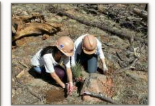
Clockwise from top: CUSP's brush truck; restoration continues in the 2002 Hayman burn scar; volunteers work on erosion control & revegetation above Colorado Springs in the 2012 Waldo Canyon burn scar