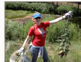
Noxious weed mitigation reduces impacts on native species, crops, & animals.

The watershed encompasses many unique ecosystems and is home to several rare species. Promoting healthy habitats and reducing the impact of recreation activities in the watershed are crucial to ensuring generations to come are able to experience and enjoy this magnificent landscape. CUSP works to protect these values through noxious weed control; river restoration; trail and road maintenance; monitoring; and erosion control.