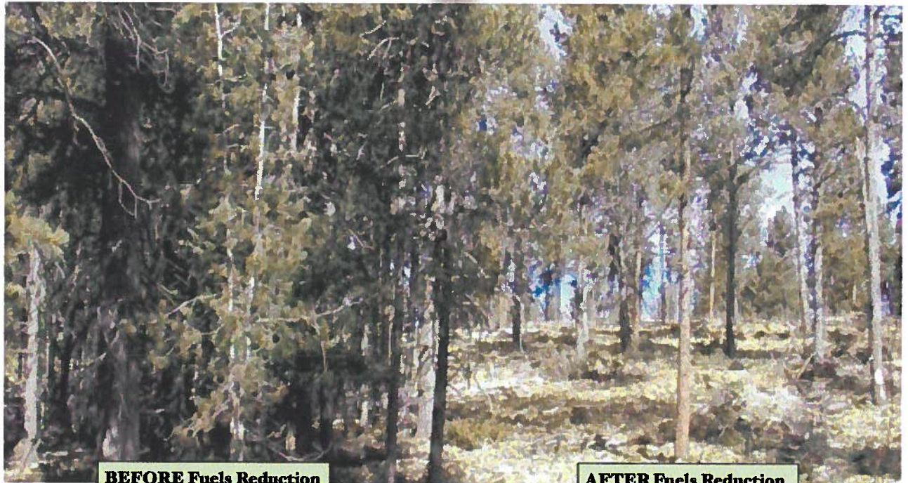
BEFORE Fuels Reduction

Mulch: Free when available (load yourself)